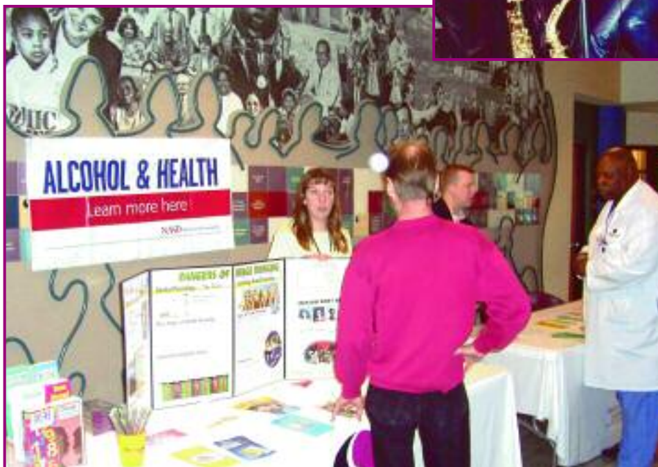
▲ Substance abuse awareness and education for the community is an ongoing effort for behavioral health associates.