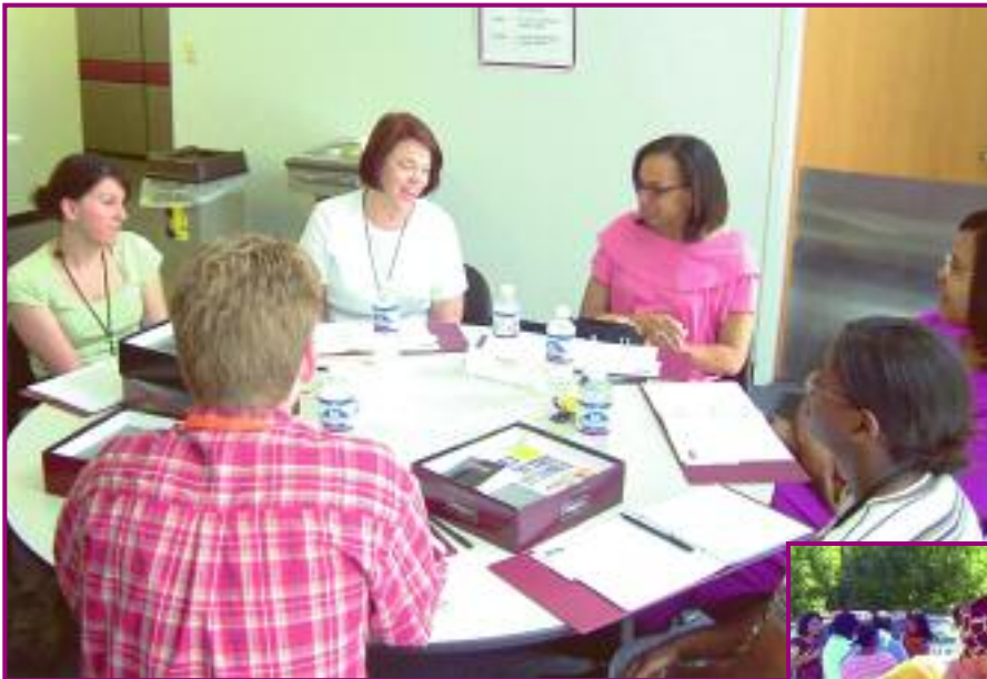
▲ Associates participate in "The Customer" training.