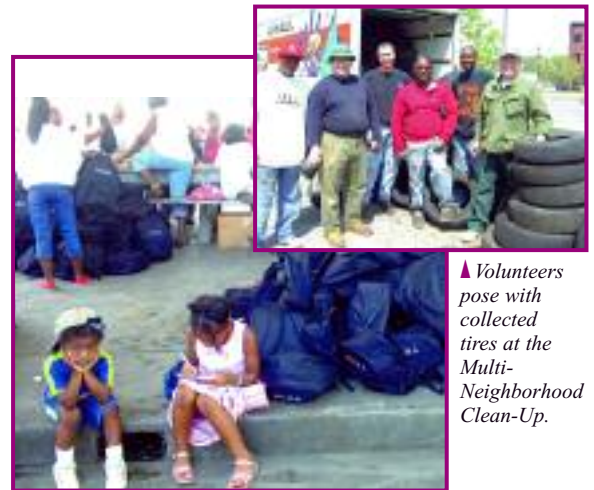
▲ Volunteers pose with collected tires at the Multi-Neighborhood Clean-Up.