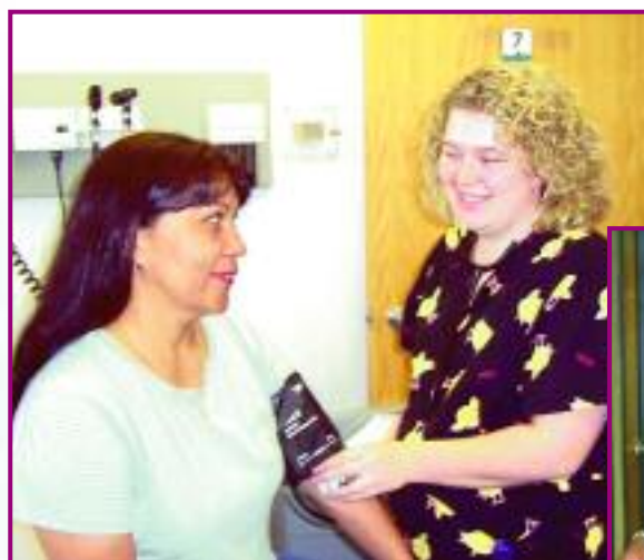
▲ Swope Health Wyandotte relocated to more spacious, refurbished offices in 2005.