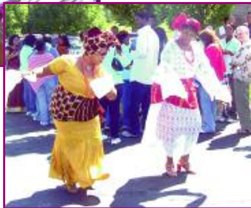
▲ Associates celebrate cultural diversity at the company picnic.